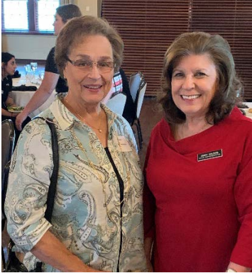
Good friends from Cedar Rapids