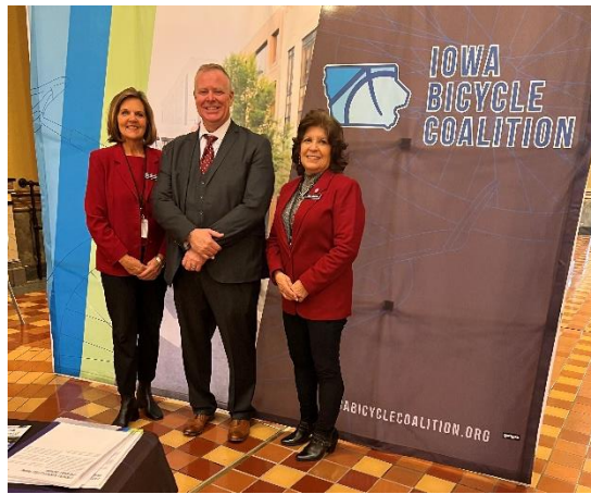
Iowa Bicycle Coalition visits the Capitol on Tuesday.