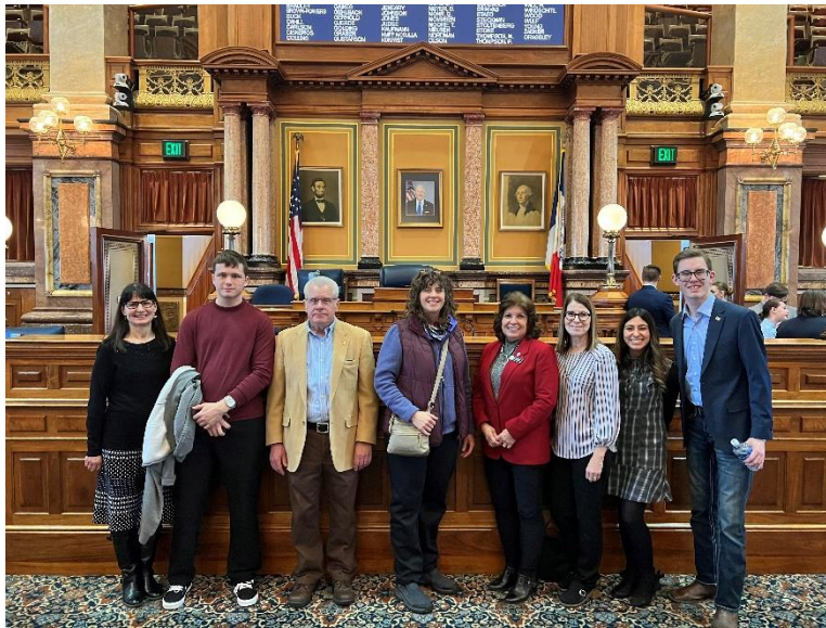
Americans for Prosperity, Linn County constituents, visited the Capitol supporting “Students First Act”