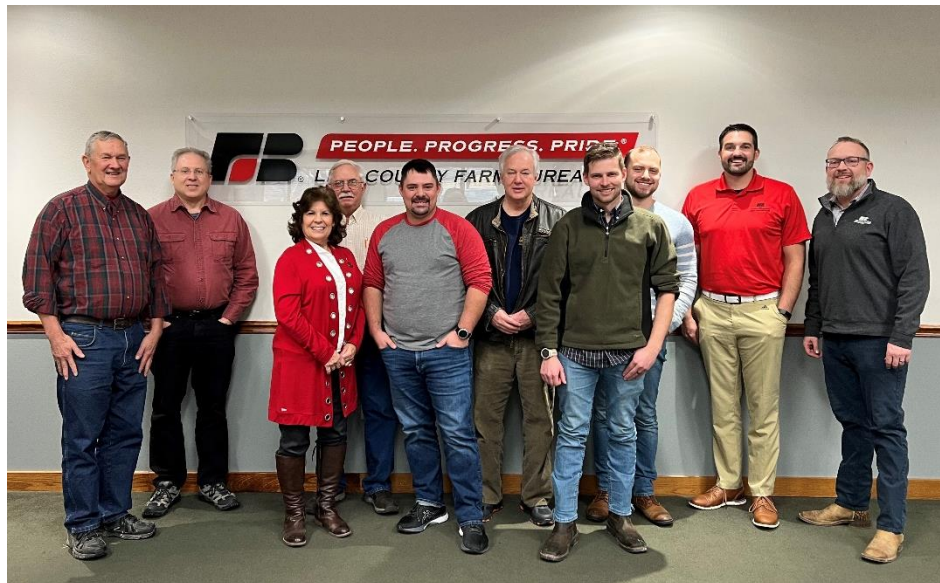
Linn County Farm Bureau forum from Monday.