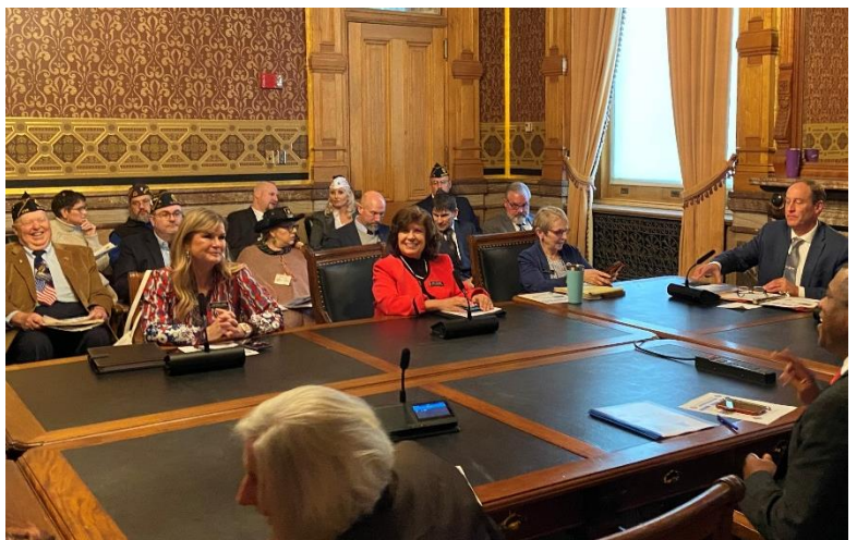
Veterans Day On The Hill and in Veterans Affairs committee.