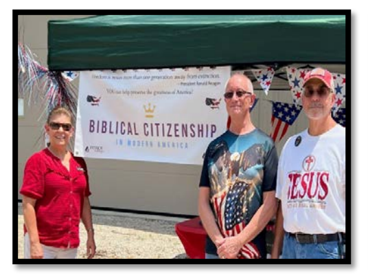
Friends at the Linn County Fair