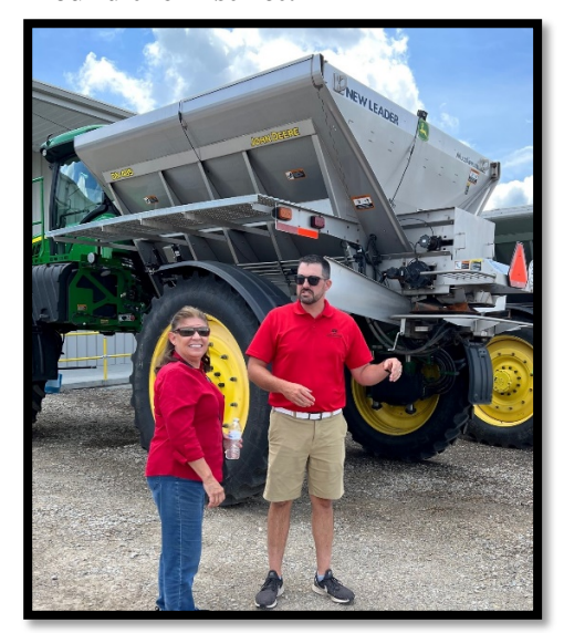
Linn Co Farm Bureau Tour Day