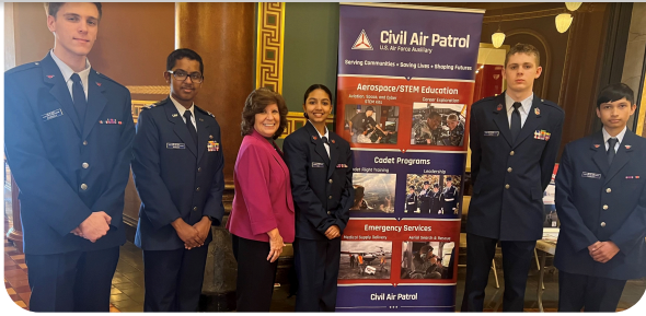
Cedar Rapids Civil Air Patrol - an amazing group of young people.