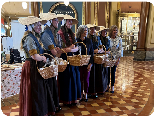
2024 Pella Tulip Queen and Court.