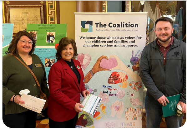
Supporting those who provide Children & Family Services