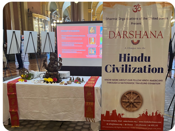
Sarshana-A Glimpse into the Hindu Civilization