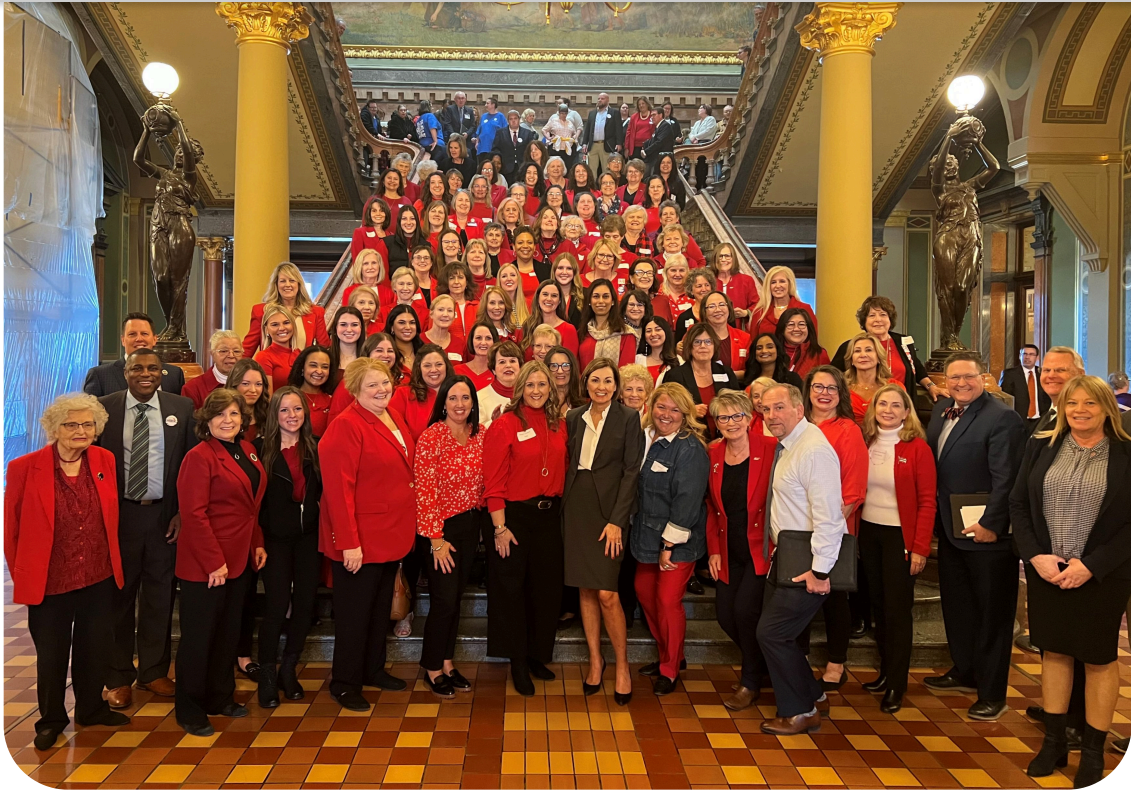
Iowa Federation of Republican Women at the Capitol - a Sea of Red throughout the building!