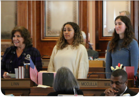
Cedar Valley Christian School students sing the National Anthem for the Chamber