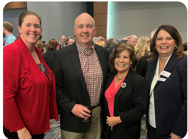
Good friends at the Celebration of Ag