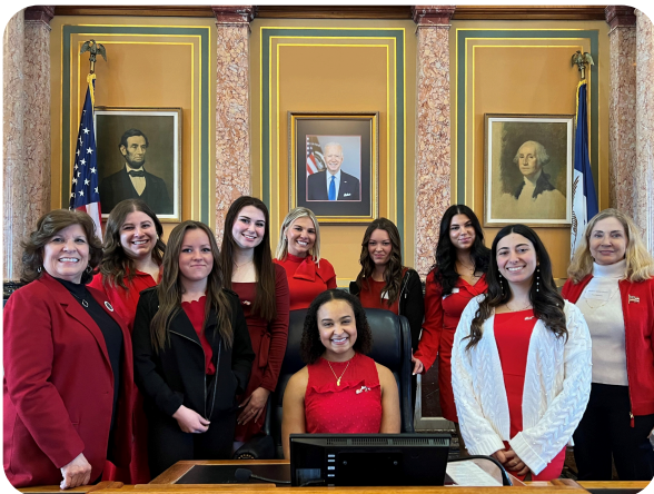
Young members of Iowa FRW