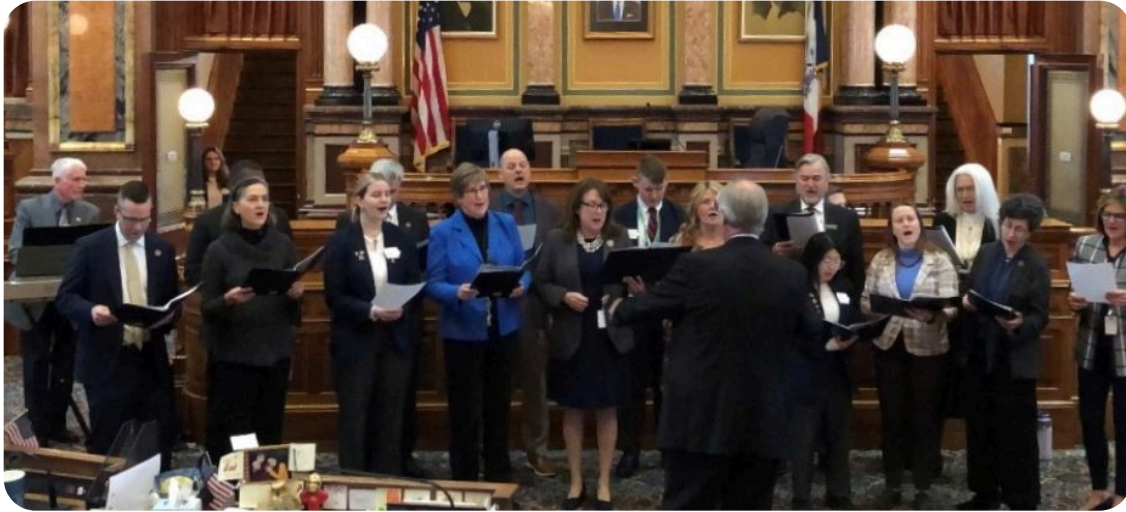
90th General Assembly Memorial Choir (click the link to hear, but it may take a moment to load)