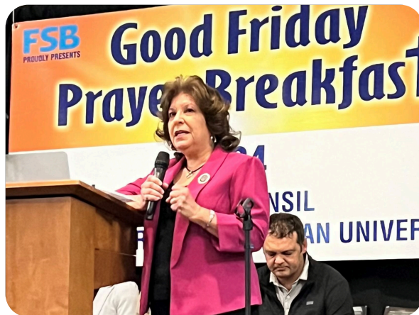
I was honored to pray for Elected officials