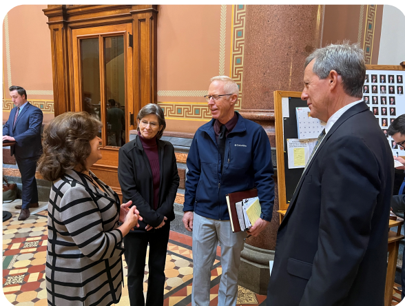
We are blessed to have Pastors pray over us in the Capitol. These folks are from House District 83.