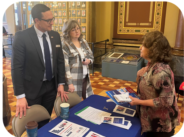
Iowa Department of Veterans Affairs Day on the Hill Hearing from Marines and County Veterans Service Officers.