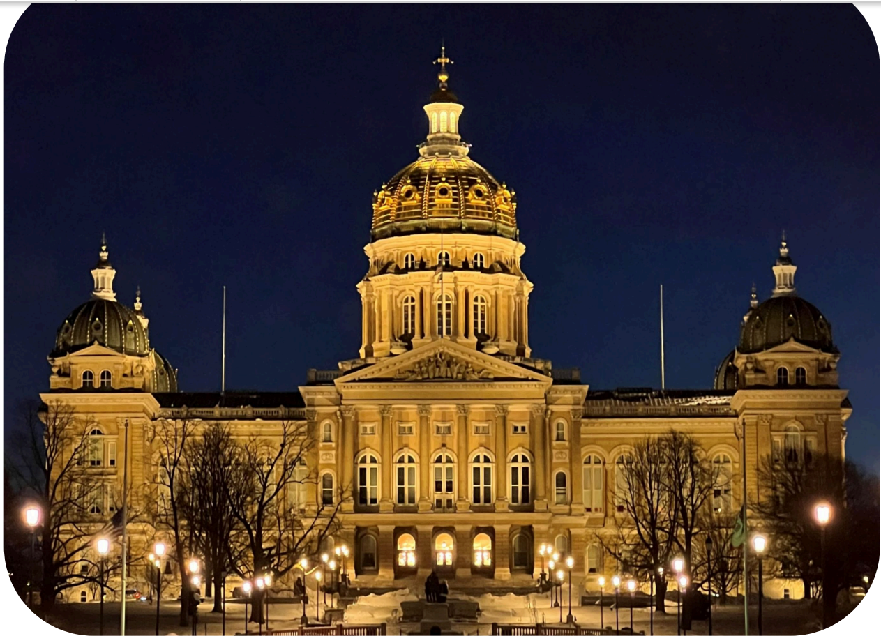
My view of the Capitol every morning on my way to work.