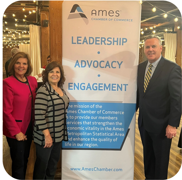
Evening event with Ames Chamber of Commerce.