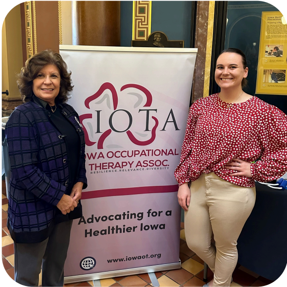
Iowa Occupational Therapy Association.