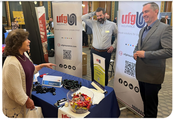
Insurance Day at the Capitol.