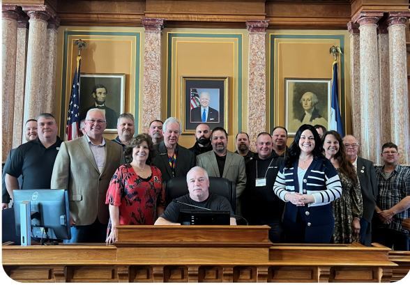
Linn County Union members visiting the Capitol sharing their legislative “wish list.”