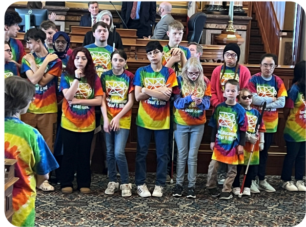
Students from the Deaf and Blind School lead the Pledge of Allegiance for the House of Representatives.