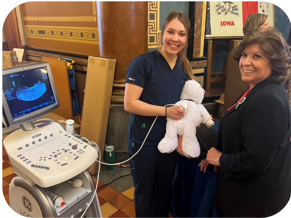
Kirkwood Community College at the Capitol. Vet tech students demonstrated equipment, including this ultra sound.