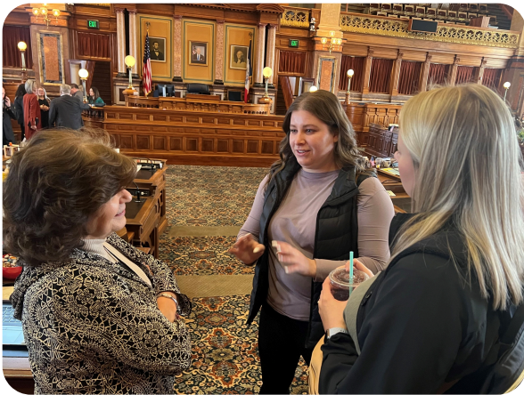
Visiting with young Republican women in the House.